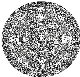
Figure 2 The Eagle Bowl Calendar

Life shall blossom with a fruit never before known in the creation, and that fruit shall be the New Spirit of Men."