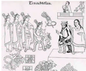
Figure 1 Moctezuma II & Cortes

Prophecies can be misunderstood, misinterpreted, and misused, and they tend to be self-fulfilling. The Spanish conquest of the Aztec empire is a perfect example of this problem. Toltec legends tell of Quetzalcoatl, a white-skinned, bearded priest-king who came from the East to establish an enlightened kingdom among the Indians. Eventually he departed by